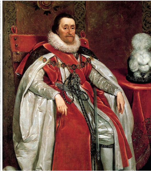
His Majesty, King James I (1566 - 1625) Founded The School by Royal Decree, 1608