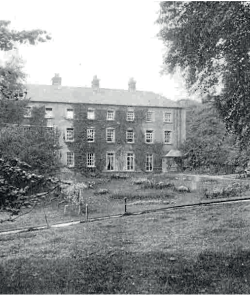
The Headmaster's House, Circa 1900

The original mission of the school was "For the encrease of learning and good manners" . The basic values of respect and good behaviour remain at the core of the school allowing pupils to have an opportunity for learning.